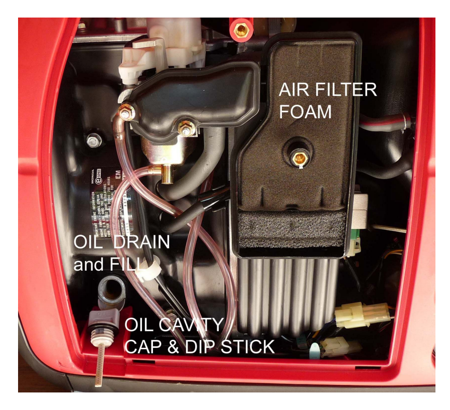
Figure 6. Oil cavity cap, dip stick and foam air filter