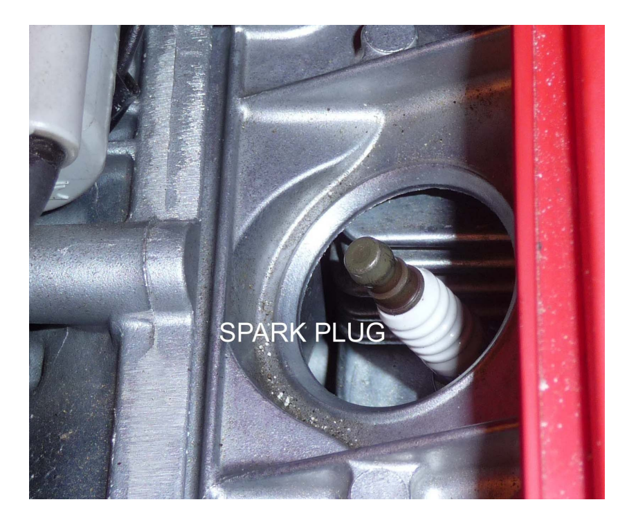
Figure 9. Spark plug

Caution: Be careful when removing the spark plug. Use a dedicated 5/8", 6 point spark plug socket with foam padding inside. Make sure that the socket fits properly seated straight over the spark plug all the way to the bottom to avoid breaking it. Breaking a plug in its seat may cause serious and expensive future problems.