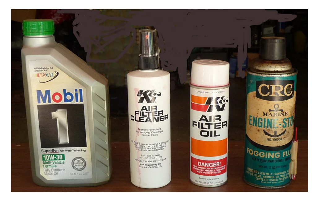
Figure 12. Fluids (air filter cleaner optional)

The empty milk bottle is for the old oil.