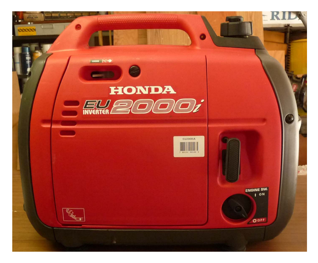
Figure 1 My generator, approximately 10 years young

Good maintenance of the generator is important and simple. These instructions are based on my use and care of three different Honda generators in the past approximately 25 years. It started with a small 400 W to 1 KW (EX 1000) to the current EU2000i. The information presented here is not a substitute for reading the Owner's manual. Read the manual and become familiar with the information and details in it. Some of the particulars in this document are from the original Honda Owner's manual.