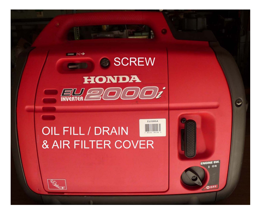
Figure 4. Oil fill / drain & air filter cover

The Honda air filter uses a foam element that can be cleaned with warm water and mild dishwashing detergent. After cleaning rinse it thoroughly with warm water and allow it to fully dry and re-oil it with filter oil. Honda suggests using engine oil, but does not give details about the oil weight. My preference is to use special air filter oil. A good source: K & N <u>http://www.knfilters.com/</u> item number 99-0504 air filter oil.