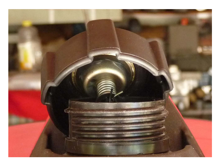
Figure 10. Gas tank cap

Do not tighten the gas tank cap prior to long term storage. Screw on the cap all the way and back it up approximately 1/4 to 1/2 turn. This will prevent the rubber gasket from forming a permanent set and grove. Make sure that the vent valve works properly. After a long storage it may stick. The clue for this condition is when the generator runs for a few minutes and stops. Open the gas cap and start the generator. If it runs properly, the vent valve is stuck. Clean it.