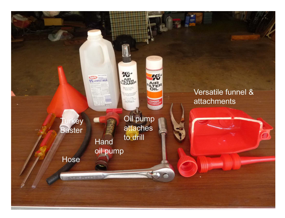
Figure 11. Tools for the job

The empty milk bottle is for the old oil.