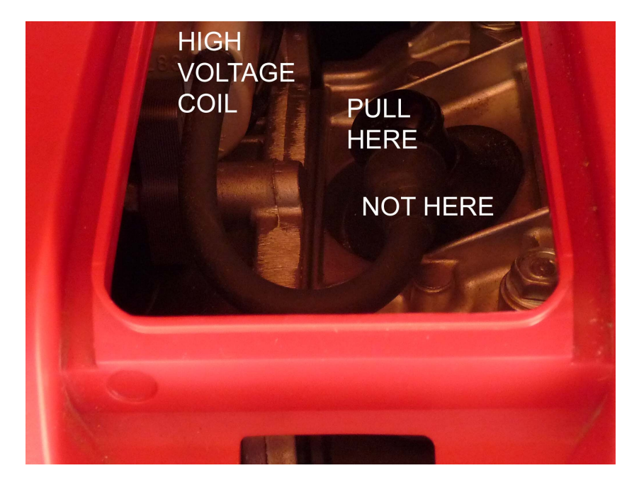
Figure 8. Spark plug cable

Carefully lift the spark plug cable from the spark plug. Do not pull on the cable . Hold the center of the circle and lift straight up.