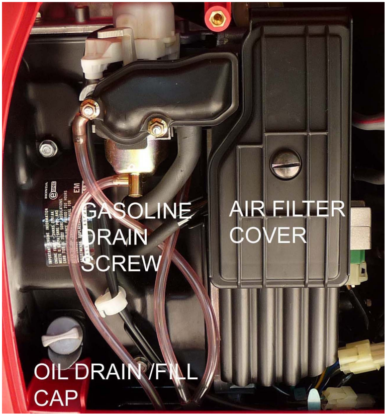
Figure 5. Location of oil cap and air filter