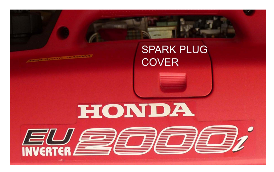
Figure 7. Spark plug cover

The spark plug is located under a small cover at the top of the generator. It may be necessary to use a flat screw driver (gently) to pry open this cover. It opens from the bottom.