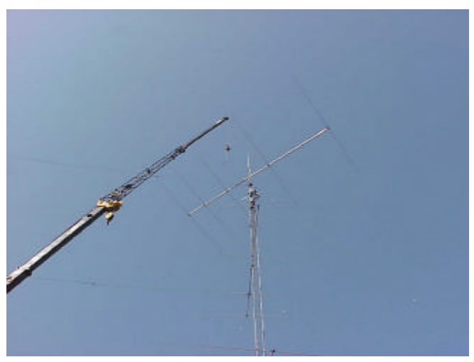
At WC6H, a 5 element KLM 20m Yagi and a 4 element KLM 40m Yagi were taken down to replace a bent mast. The crane is sure a good way to move things around up there!

the renewal form and your dues check to: