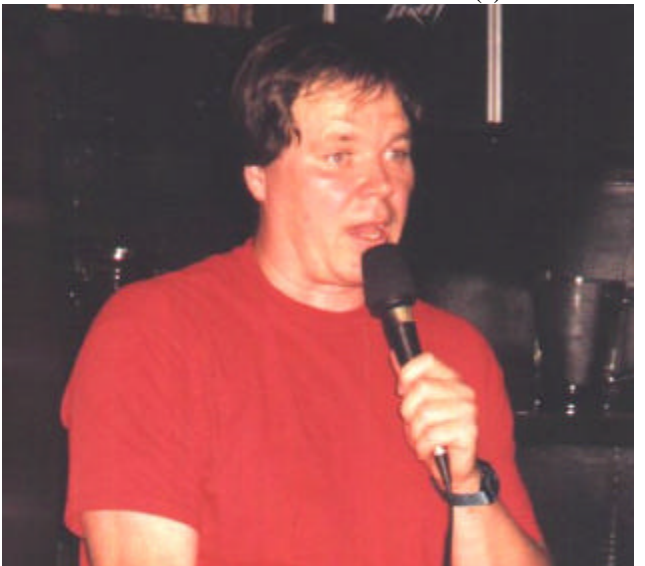
N6TR presenting SPRINT information and hints at the August Meeting.

Tree offered a few pointers on improving your Sprint score. He suggests you consider a band change from 20 to 40 when your rate drops to 50% of your beginning 10-minute rate, usually 1 to 1.5 hours after the start of the contest. In general, try to go to 40 as late as possible vs. "the crowd." If you end up going to 40 early, plan to go to 80 early, also. To increase mults it pays to know which band they are liable to be on (or that you're liable to be able to hear them on); try slowing down your code speed to pick up some of the slower ops who happen to be mults; call a lot of CQ's; keep checking 20 for stray mults; and use a second radio to look for mults on the other band(s).