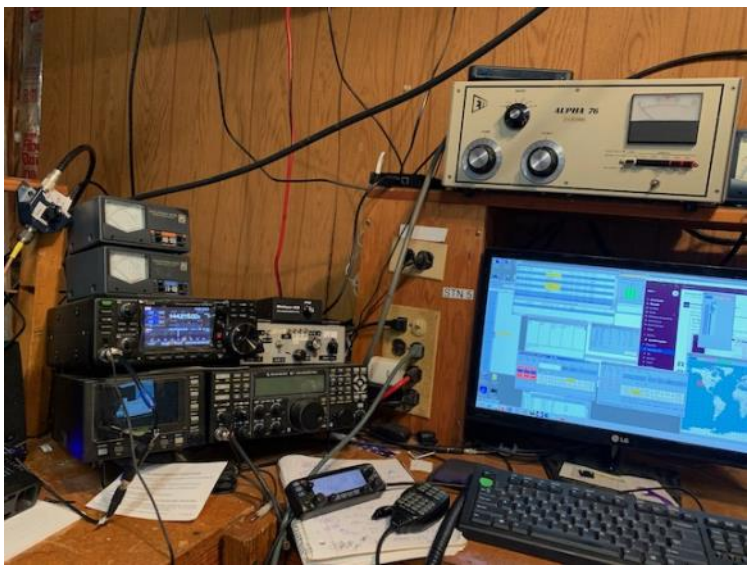
Station 1 at N6RO During VHF Contest June 2021