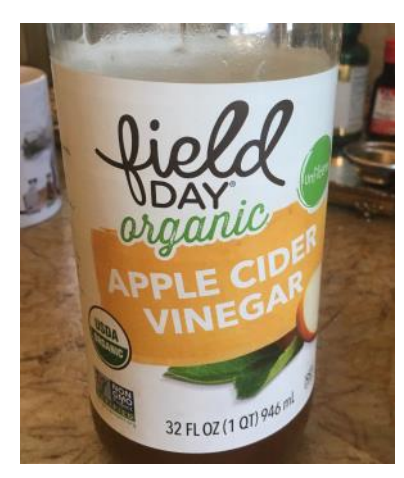
For additional Field Day food items see www.fielddayproducts.com

Naturally, the importance of an appropriate FD beverage can't be over-emphasized, and what could be more appropriate than "Field Day Vinegar" . . Well actually, beer — it was over 90 degrees in the shack.