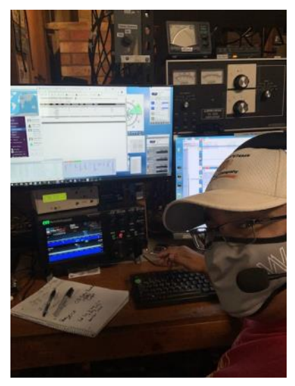
Rookie Round-up in2021 from N6RO