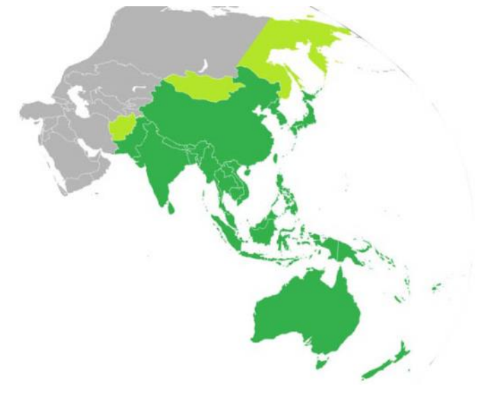
The green areas are officially Asia and Oceana; yellow are optionally included in Asia from a geo-political sense, and the grey area, more or less, are the expanded ham radio designation for Asia.