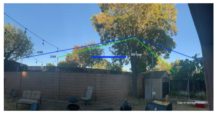
The W6DMW Urban Antenna Farm

side and fish time. BBQing keeps me in a shape (round). Off-Roading gets me out of the house and in the woods. My little one loves it too so we get some great one on one time without the electronics to distract him. It was also the catalyst to getting my license in the first place. Who knew it would be a gateway to the contesting and DX world.