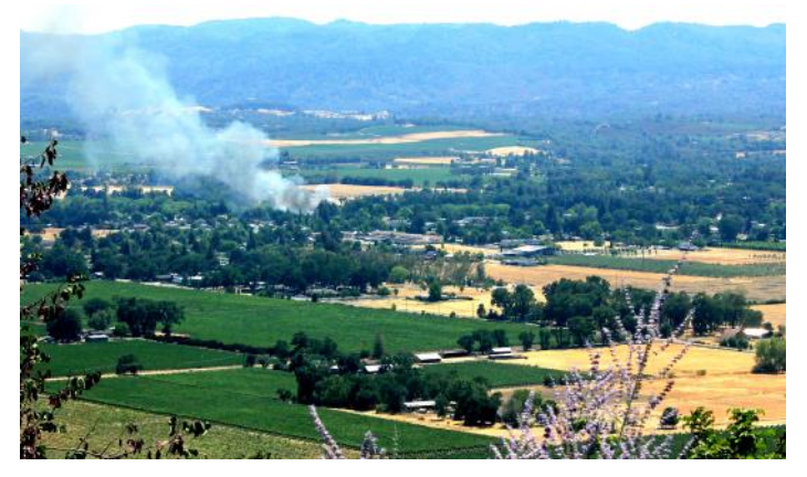
Field Day Fire in Kelseyville CA, photographed from the N6ZFO mountain top.