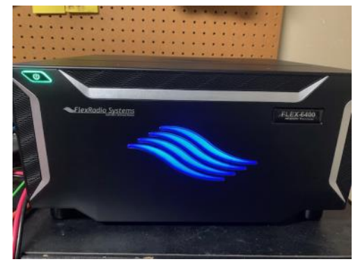
David's favorite ratio—A Flex, a laptop and the antennas, all configured for maximum contest fun.