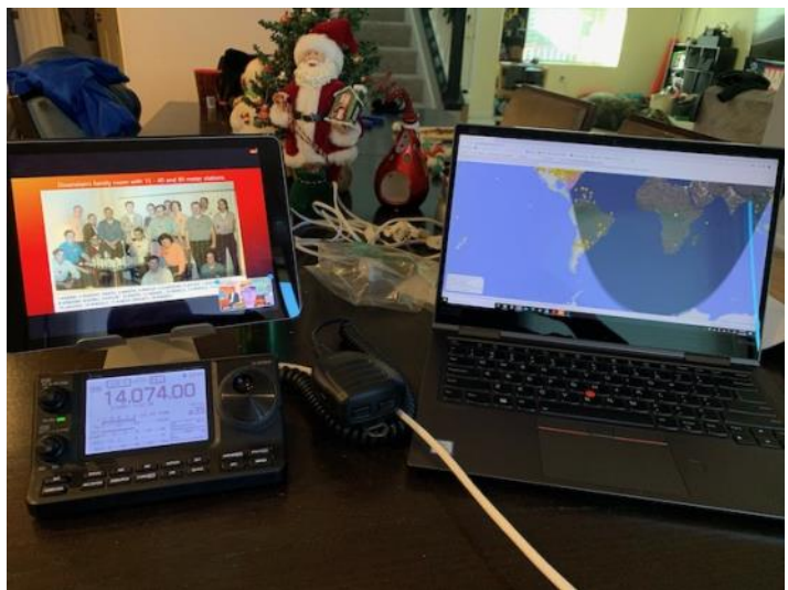
W6DMW. . Operating the 7100 during an NCCC meeting.