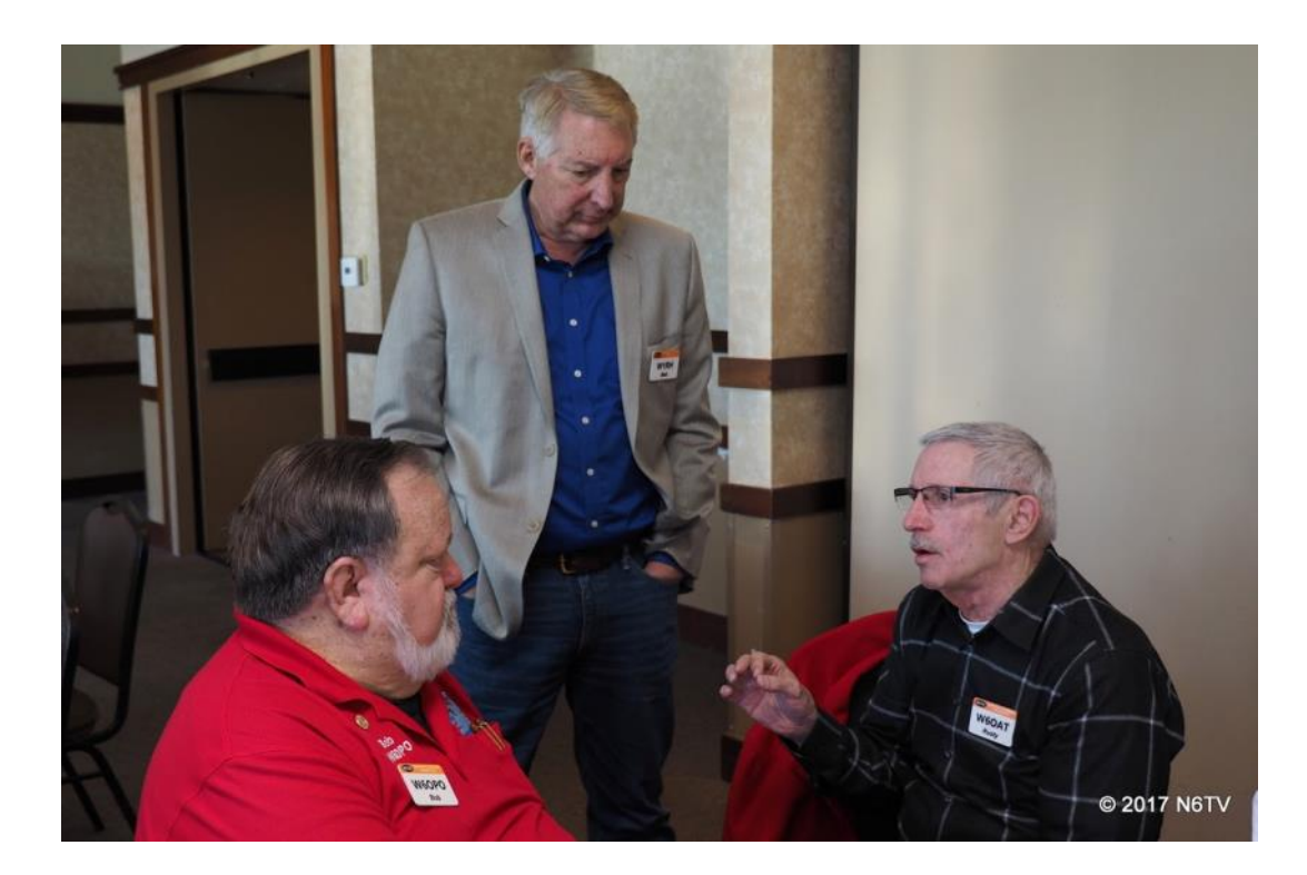
W6OPO, W1RH, W6OAT