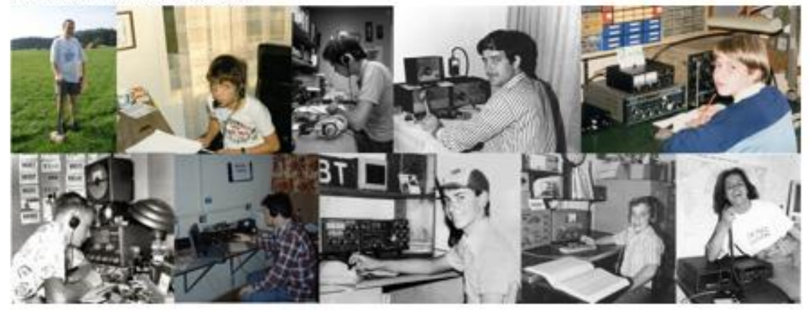
Starting young - teenager contester from five Decades

Another view point shows a very uniform picture. Almost all of the participants started amateur radio as teenagers, i.e. they acquired their first license as a teenager and continued into a lifelong radio sport passion. The survey showed an average age of 13.3 years when the competitor's first amateur radio license was <u>achieved</u>. Starting young - teenager contester from five decades