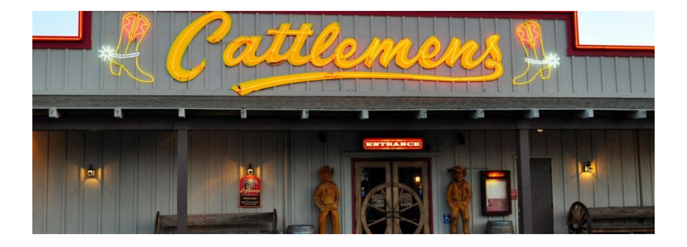
Saturday 3rd February 11:30 am

Cattlemen's, 2882 Kitty Hawk Rd, Livermore, CA 94551