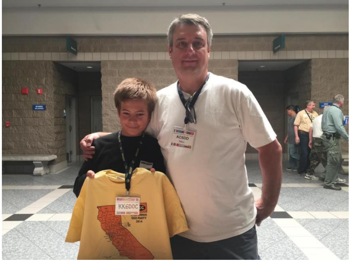
Father & Son team