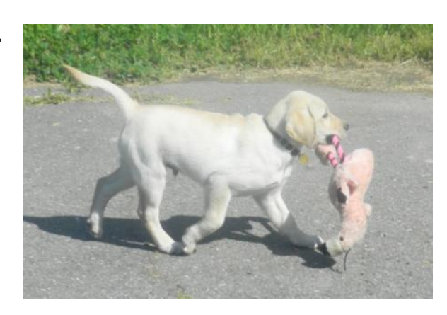
Dodge the Dog: faithful shack companion who turns one year-old on January 8 and plans to be at our meeting.