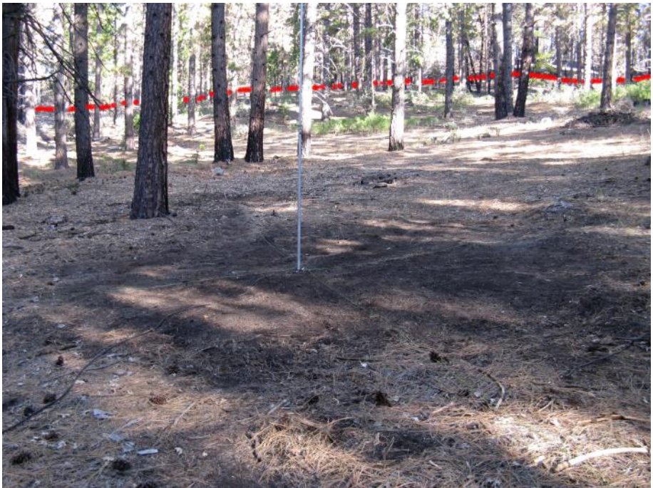
Above— Burnt Trees on Evergreen Road

Dotted Red line shows how close the fire line was to the 40M vertical.