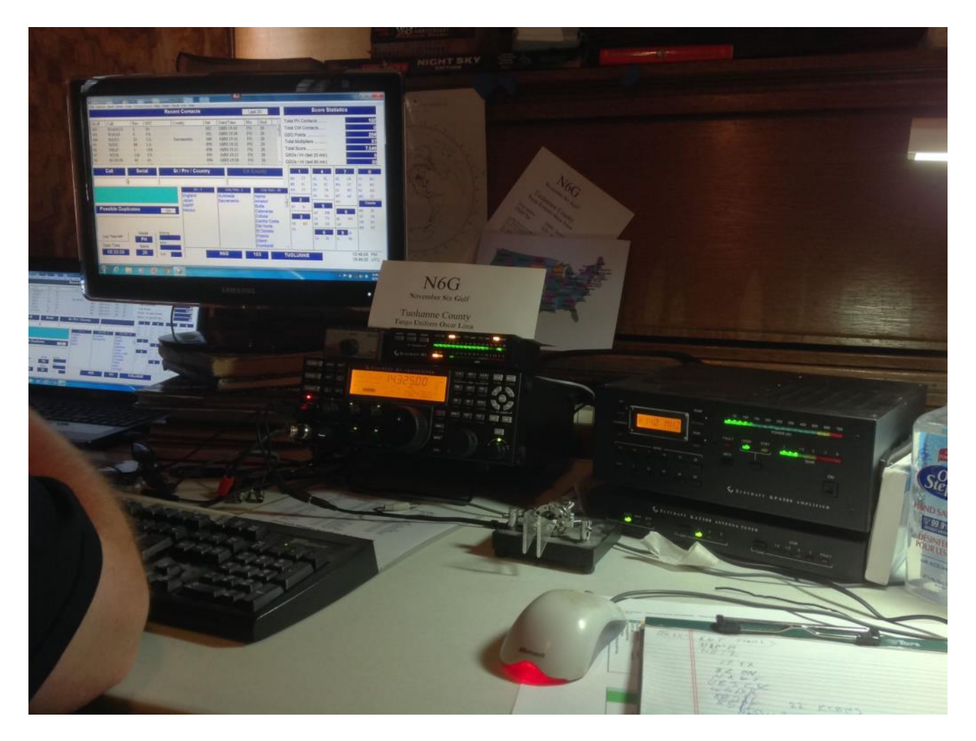
N6G Station— Elecraft K3, KPA500, KAT500

The food was way more than acceptable and adequate; it was great and amazing; way better than at any radio expedition that we've ever been on. Having meals together, often shutting down the radio, was very enjoyable.