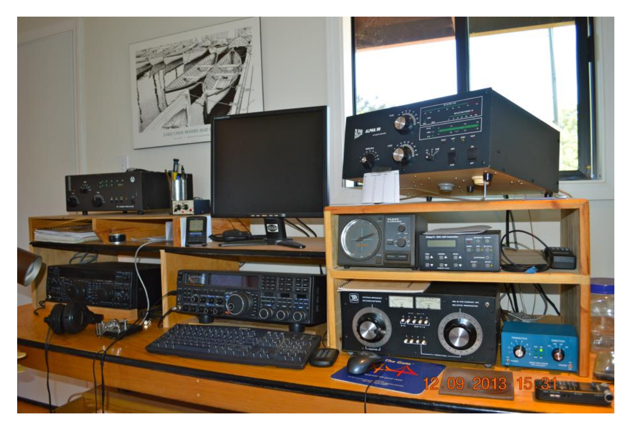
K6SRZ as presently constituted

Is change in the air? Certainly many thoughtful amateurs are proposing changes to business as usual. Among the most frequent suggestions are (1) make contests shorter (2) change the multiplier schemes to reflect the distances involved [the continental USA encompasses three CQ zones and one (!) country multiplier. Europe spans three zones, but almost 60 country multipliers] (3) use the power of the Internet to design different collaborative strategies that transcend the traditional boundaries, including continental boundaries and club circles.