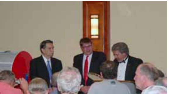
W6RJ, OH2BH and K7JA