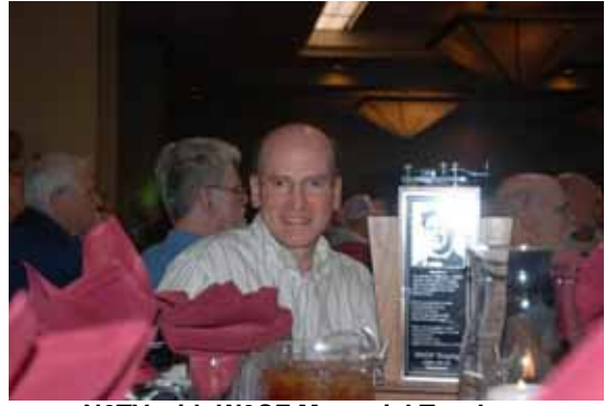
N6TV with W6CF Memorial Trophy