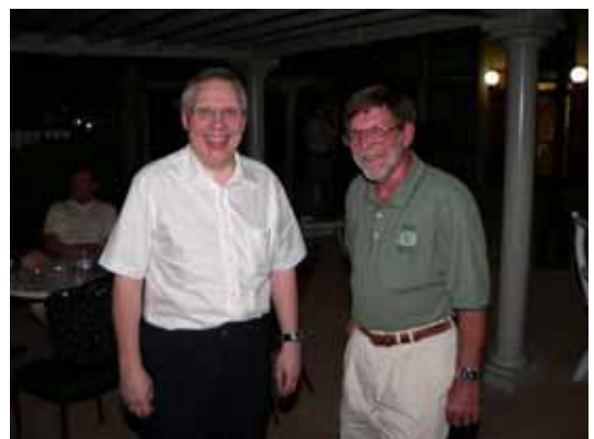
F6BEE, W2GD (P40W)