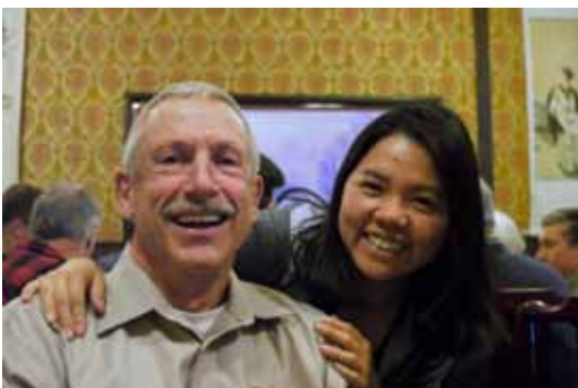
W6OAT and former employee

The first ARRL 160 contest was actually held on December 12, 1970. It's really one of the more recent contests. Back then, you got 2 points per section (there were 74) plus one for VE8, and one for any number of DX stations worked. That gave you a maximum of 76 points. You did get 5 points for DX contacts.