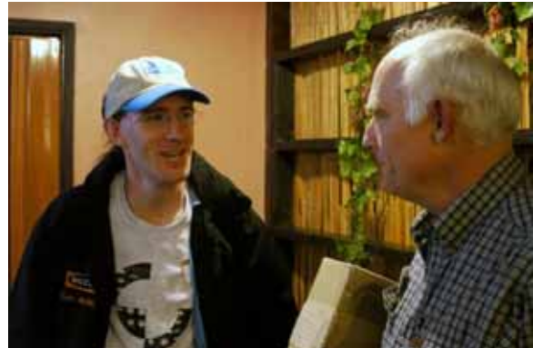
N6ML and W0YK