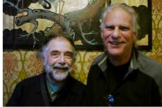
N16T and K6SRZ