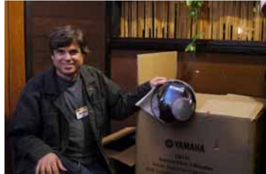
W6XU and lots of CM500 headsets