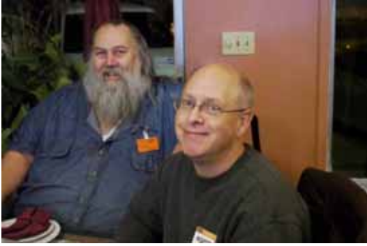
N6AJR and KG6TT