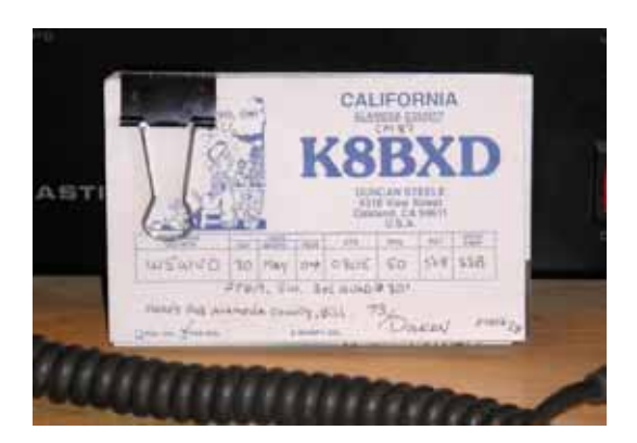
Stack of 6 meter CA County QSLs