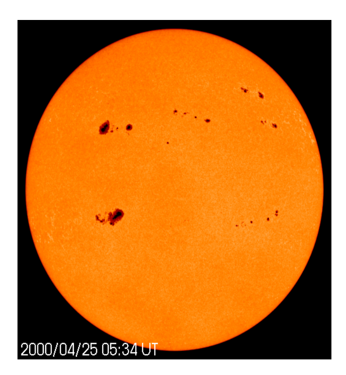
Keep the faith, baby. These, too, shall return.