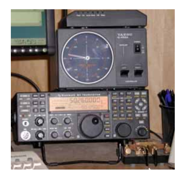
K3 at W5WVO set on 6 meters