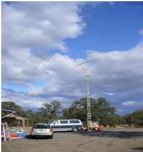
Tehama: N6RNO = NO6X, K6MI, WB6HYD, N3ZZ, K6VLF