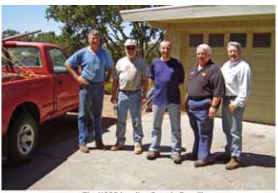
The NGCC Loading Crew in Danville (L to R) W6NV, N6RO, KX7M, K5RC, W5FU