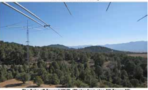
Take-off Toward VK/ZL (Photos from atop 80' Tower #2)