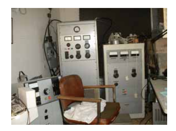
The amplifiers at W6KW. Any resemblance to the set of a 1950s sci-fi movie is purely coincidental