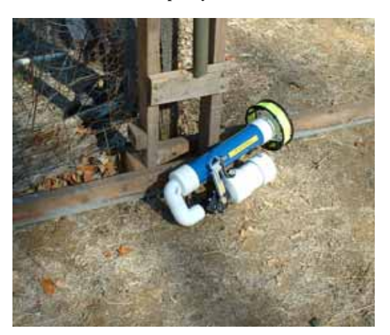
K6SRZ's (W6PZ) secret weapon for CQP: the WB6ZQZ tennis ball launcher. This will put an antenna line 150 feet in the air!