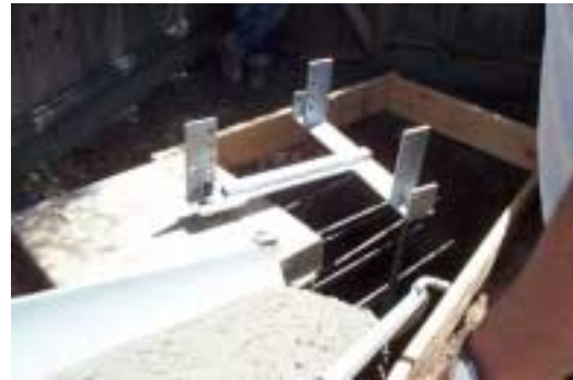
With one anchor bolt and one end of the base plate attached to the old footing, the other two bolts and the larger end will be sitting in the newly poured concrete.

The next morning the anchor bolt was fixed to the old footing with epoxy. The new tower T-base and the two other anchor bolts were then attached to the first anchor bolt. The two other bolts would be fixed into the newly poured concrete. In this way, we distributed the stresses on the new base plate between the old footing and the new slabs. Then, the excavated area was bordered by wooden forms to await the arrival of the concrete.