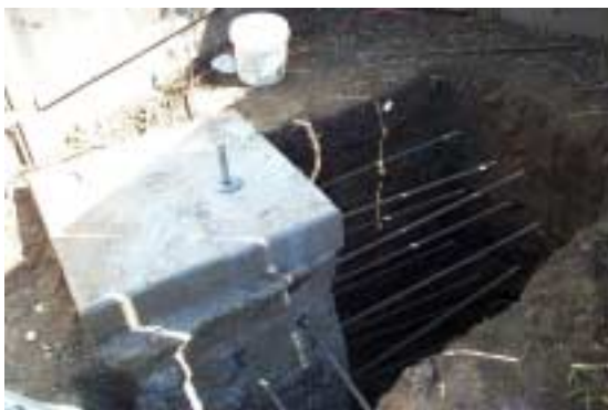
Holes drilled in the open faces of the footing are filled with rebar stubs. These will provide strong binding between the old footing and the newly poured slabs.

Using a heavy-duty drill and concrete bits, about a dozen holes were drilled horizontally in the face that would be joined to the largest slab of new concrete. Fewer holes were drilled in the other face. These were filled with rebar stubs.