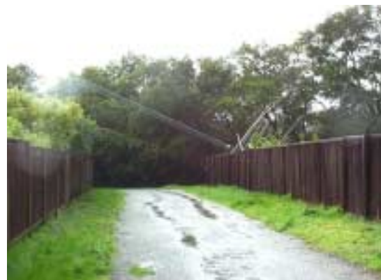
The tower had fallen across a fire-access road, and the yagis were resting in my neighbor's backyard.

I put on a jacket and ran outside to make sure no one was hurt, and to assess the damage. The tower had come down across a 24-foot wide fire-truck access road and the top section, mast and yagis had hit ground in my neighbor's yard.