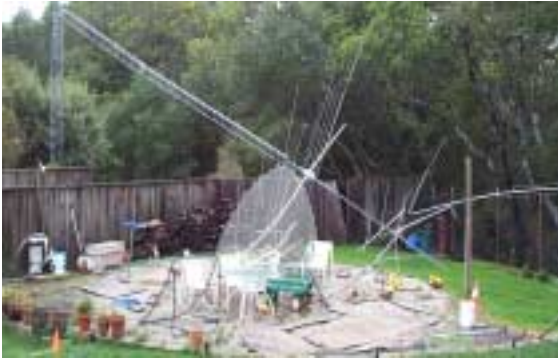
Because of the angle at which it hit, the two yagis took the brunt of the impact. Interestingly, though, the rotator and mast emerged unscathed.

section had hit the top of my neighbor's wooden gate, splintering it. The mast and yagis had hit the ground and the yagis were reduced to an unrecognizable jumble of twisted aluminum.