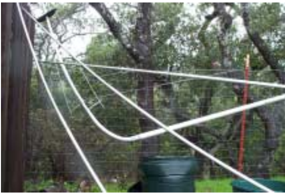
One of the linear-loaded elements of the MAG 240N was bent back at more than a 90-degree angle. The boom of the C31-XR had one-third of it snapped off with five of the seven ten-meter elements.

I stood there amazed at the transformation. Then, I realized I was soaking wet. I went back to the house and changed out of my wet clothes. Afterward, I called my neighbors. I got the answering machine because the kids were in school and the parents were at work, so I left a message. I then called my insurance agent.