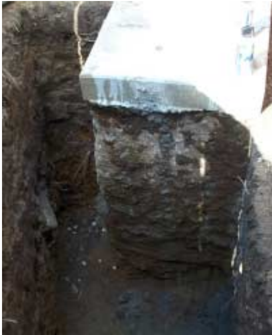
The old tower footing is exposed after digging the new trenches. The earth is very compacted which gives the footing even more resistance against uprooting.

After digging the trenches, we found that the underlying earth was very compacted. That would add even more insurance against tower uprooting.