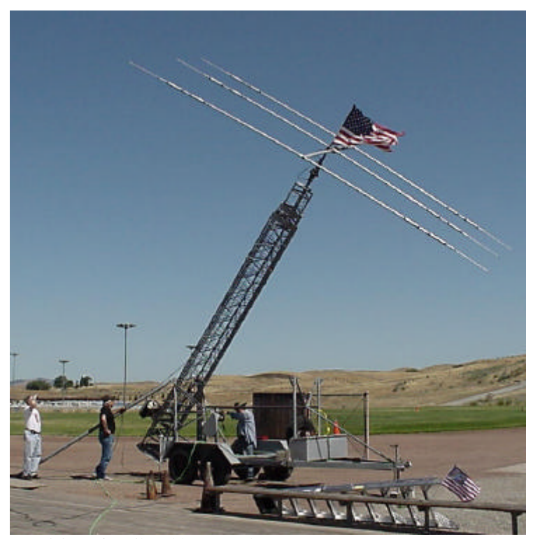
Raising of a triband beam at the recent W6VOM Field Day event in Alameda County.

If you don't have web access or a printer, let me know. I'll send you some of the material by mail or email. I can also send you this article in electronic form so you won't have to type in all the URLs. You can email me at: preas@parc.com