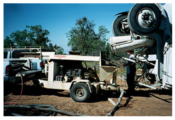
Concrete pumps are truly slick machines! Here is the business end. It pumps mud through a two inch hose.