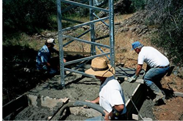
Topping off the tower rebar-ed into the rock. You can see a stream of concrete coming out of the hose.