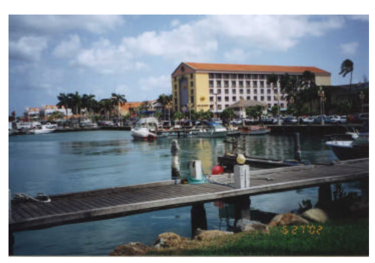
on the southwest coast) is "hotel row" populated by a succession of hotels and beach resorts. Some are bcal but chains are also represented, including Marriott, Hyatt Regency, Wyndham and Holiday Inn. The all have beaches and casinos.

I took an auto tour of the island today, starting by driving down the main road south from Carl's. The island is only about 30 miles long. The main town, Oranjestad, is about 6 miles to the north, just past the airport. Two or three miles north of there (all