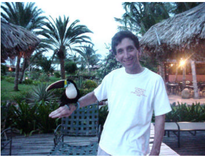
Tukee and K2KW enjoy non-contesting activities on Coche Island, Venezuela.