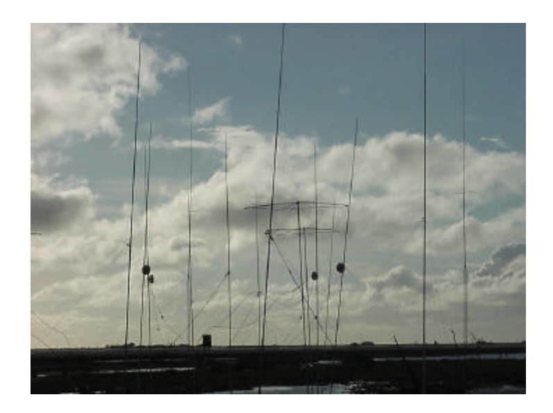
The "Vertical Forest" at 4M7X during a good moment.