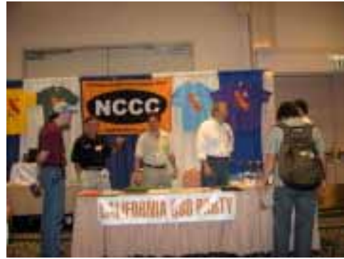
K6IAM, N6BV, K6XX, K6MM