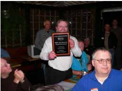
W6ZZZ wins Jim Maxwell Award