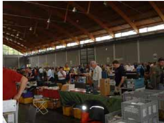
At Friedrichshafen, the ham crowd mills around the flea-market tables.

There are free shuttles to a variety of locations including satellite parking which seemed to be pretty much necessary if you drove. There is close-in parking but I think it was reserved. The weather was beautiful, warm and quite humid by California standards. Air conditioning is marginal in most public spaces and non-existent in smaller hotels but I slept well and thoroughly enjoyed the weekend. Try it yourself some time.