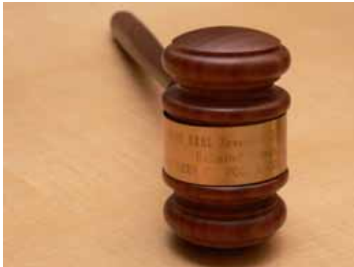
One more time...NCCC earns the coveted Sweepstakes Unlimited Club Competition gavel.