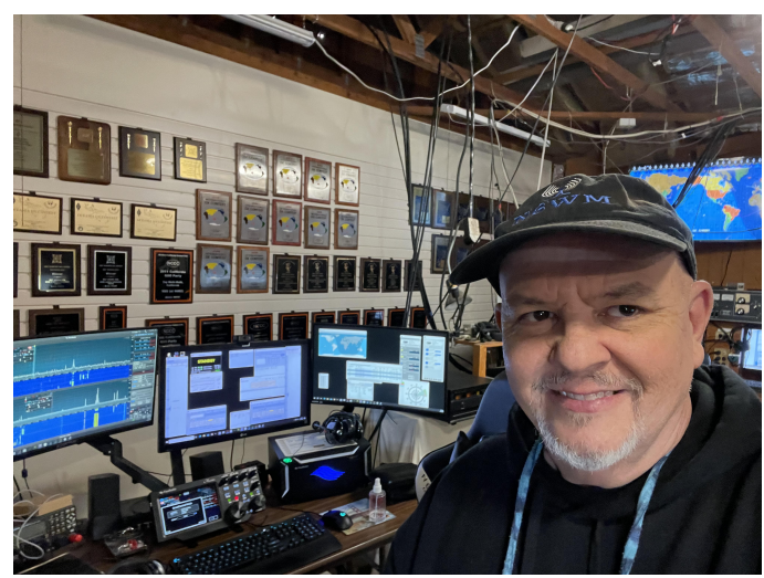
N6WM, in the ARRL DX CW at N6RO

Greetings my fellow contesters. I wanted to share some thoughts coming off of 2 contests that represented stellar band/solar conditions as we teeter on the peak of the current solar cycle.