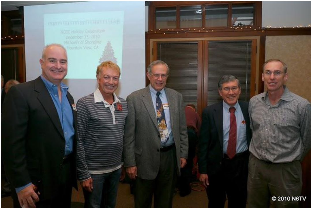
N6MEF, N6DQ, W6EB, N6BV