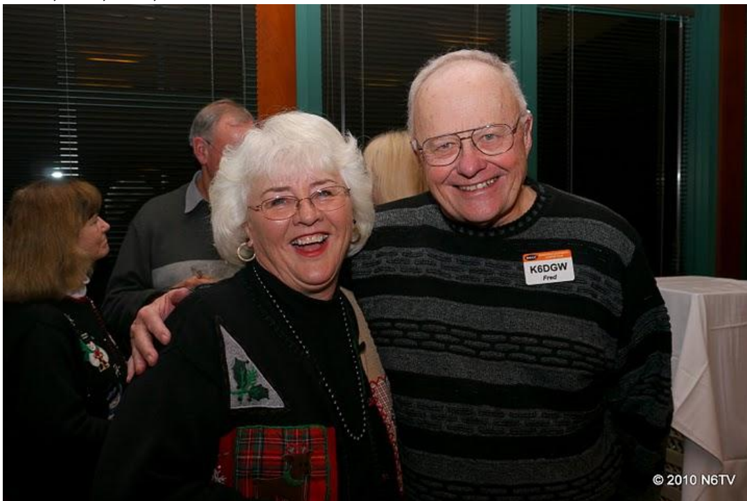
K6DGW XYL, K6DGW