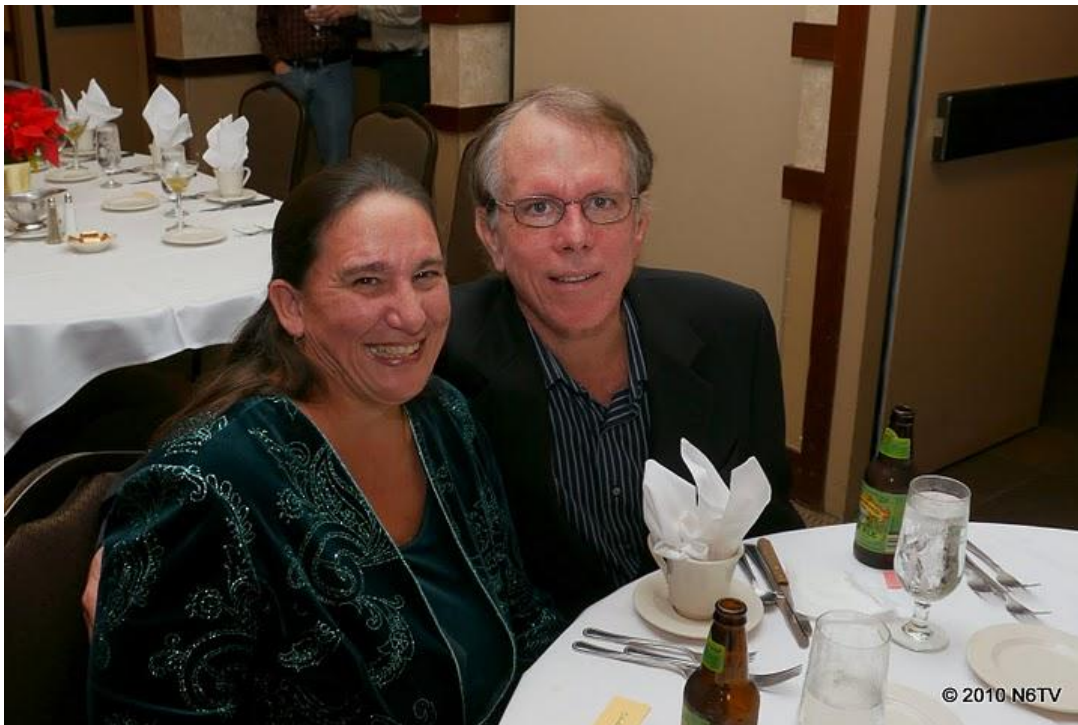
KI6ARW & KE6QR