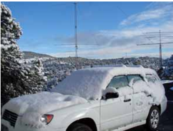
What summer? The scene outside K5RC aka W1CU in WPX.

Here are some photos of a few WPX efforts: