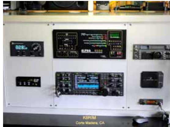
K6RIM, with 7800 and new Alpha 9500. Said Al, "conditions sucked."