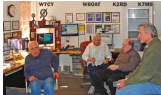
What to do when the A Index is 26 in WPX CW.