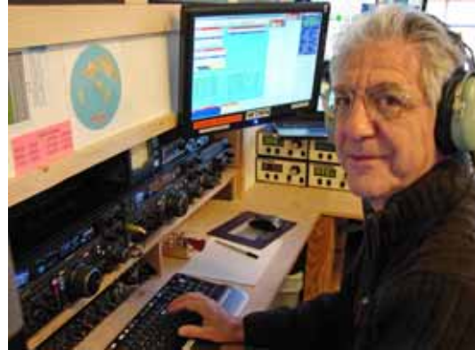
The scene inside at K5RC aka W1CU.