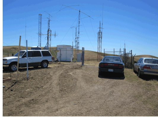
K6LRG station in Livermore