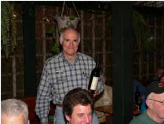
Like Ed, W0YK, really needs a bottle of wine! But, he'll take it.