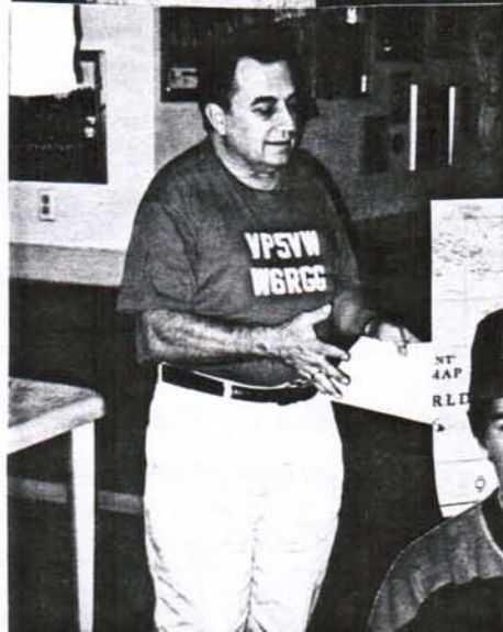
ABOVE: MEETING SPEAKERS WM2C AND W6RGG TELLING US HOW TO GET READY FOR THE DXPEDITION THING.