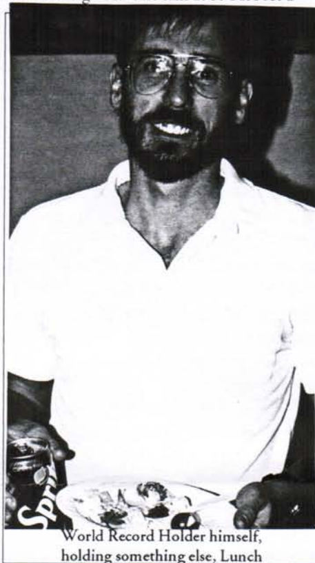
World Record Holder himself, holding something else, Lunch