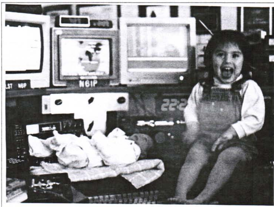
Wolbert offspring, readying for SS?