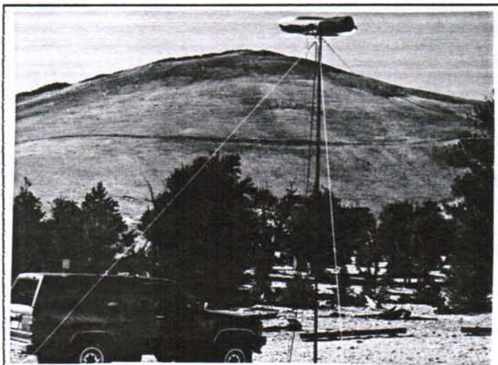
WA6FIT OPERATION SITE AT 11160 FT.

WHITE MOUNTAINS MONO COUNTY.