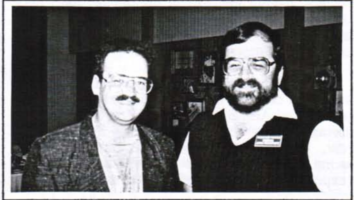
KI3V BROUGHT GUEST WB2EEK FROM PVRC TO THE BANQUET