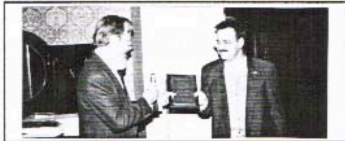
N6EK PRESENTS CHAIRMAN'S AWARD TO KI3V