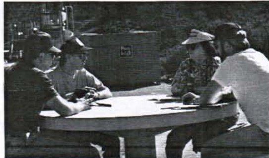
N3AHA N6TV KA6ING KJ6LD Get Serious at Board Meeting August