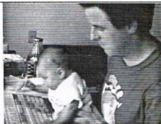
You didn't think N6IP wrote these Voice Keyers articles all by himself did you?