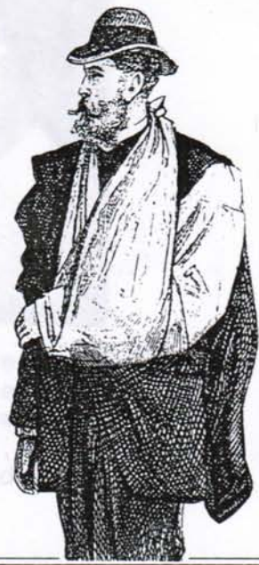
Southpaw contester leaves orthopedic clinic after 48 solid hours of CQ WW using a straight key only.