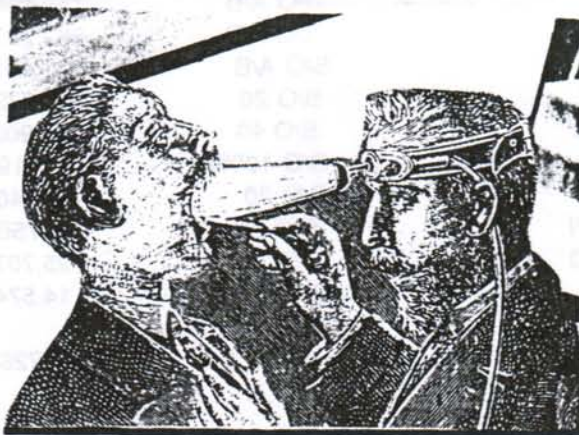
Avid phone contester (left) consults otolaryngologist about acute loss of vocal ability following 48 hours of uninterrupted operation in CQ WW SSB.