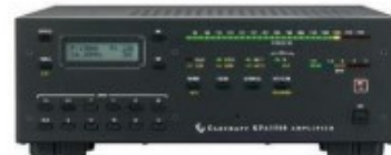
The K4 interfaces seamlessly with the KPA500 and KPA1500 amplifiers

'The performance of their products is only eclipsed by their service and support. Truly amazing!' Joe - W1GO