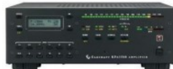
The K4 interfaces seamlessly with the KPA500 and KPA1500 amplifiers

'The performance of their products is only eclipsed by their service and support. Truly amazing!' Joe - W1GO