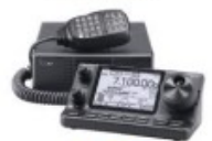
IC-7100 All Mode Transceiver