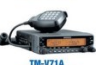
TM-V71A 2M/440 DualBand