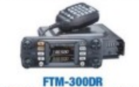
FTM-300DR C4FM/FM 144/430 MHz Dual Band