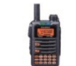
FT-70DR C4FM/FM 144/430 Xcvr