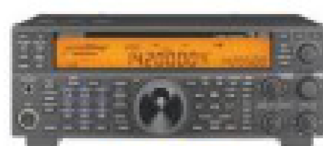
TS-590SG HF/50MHz Transceiver