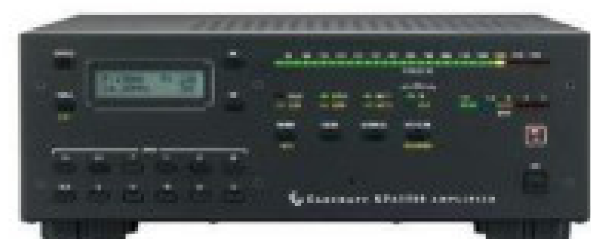
The K4 interfaces seamlessly with the KPA500 and KPA1500 amplifiers

'The performance of their products is only eclipsed by their service and support. Truly amazing!' Joe - W1GO