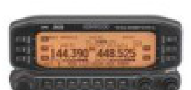
TM-D710G 2M/440 Dualband