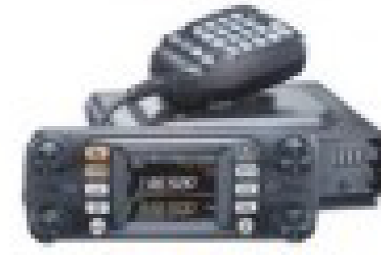
FTM-300DR C4FM/FM 144/430 MHz Dual Band