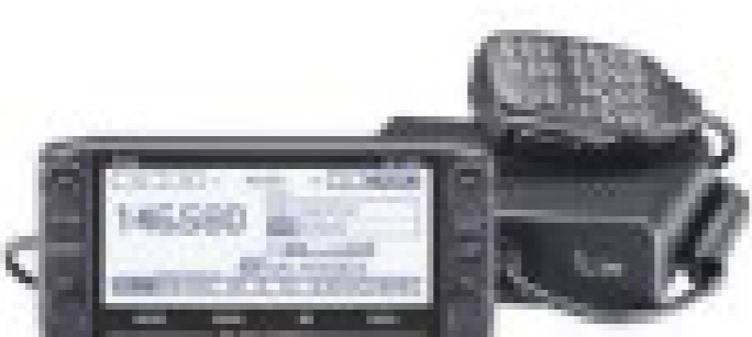
ID-5100A Deluxe VHF/UHF Dual Band Digital Transceiver