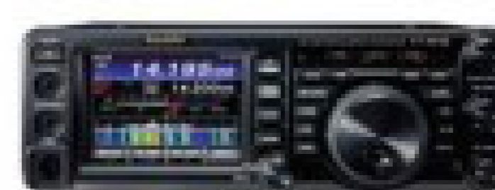
FT-991A HF/VHF/UHF Transceiver