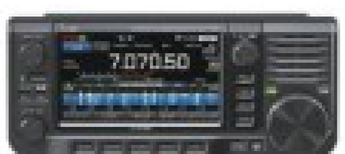
IC-705 HF/50/144/430 MHz All Mode Transceiver