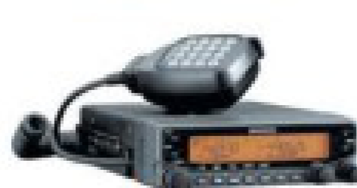
TM-V71A 2M/440 DualBand