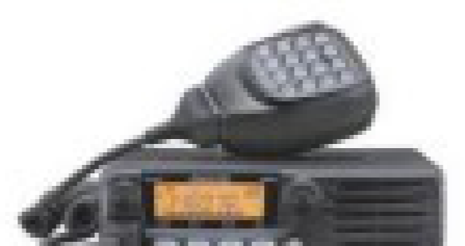
TM-281A 2 Mtr Mobile