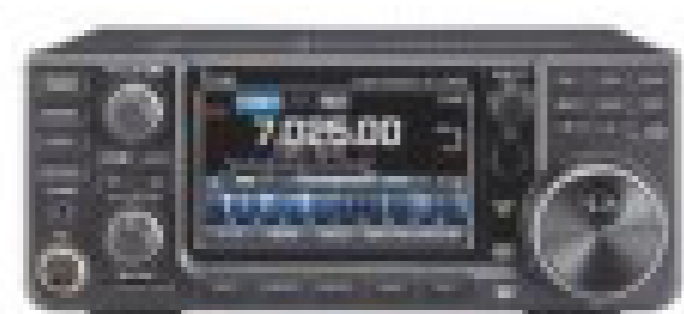
IC-7300 HF Transceiver