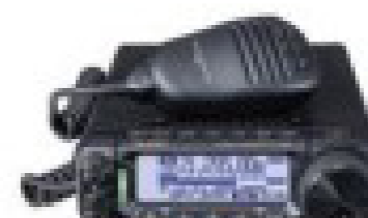
FT-891 HF+50 MHz All Mode Transceiver