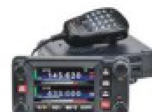
FTM-400XD 2M/440 Mobile