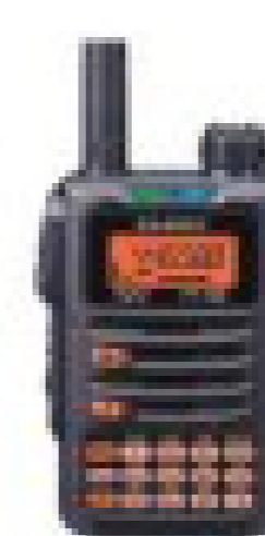
FT-70DR C4FM/FM 144/430 Xcwr