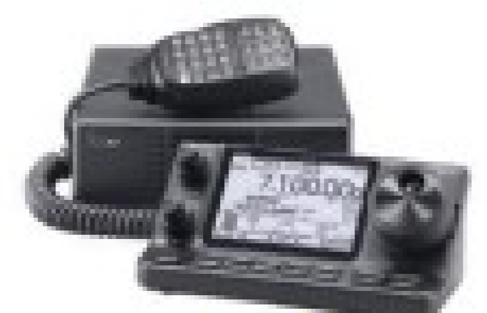
IC-7100 All Mode Transceiver