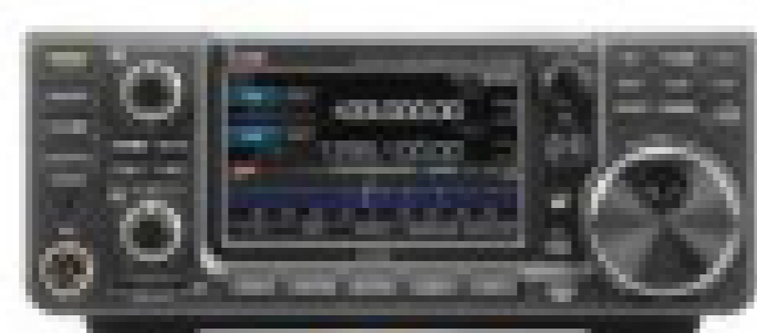
IC-9700 All Mode Tri-Band Transceiver