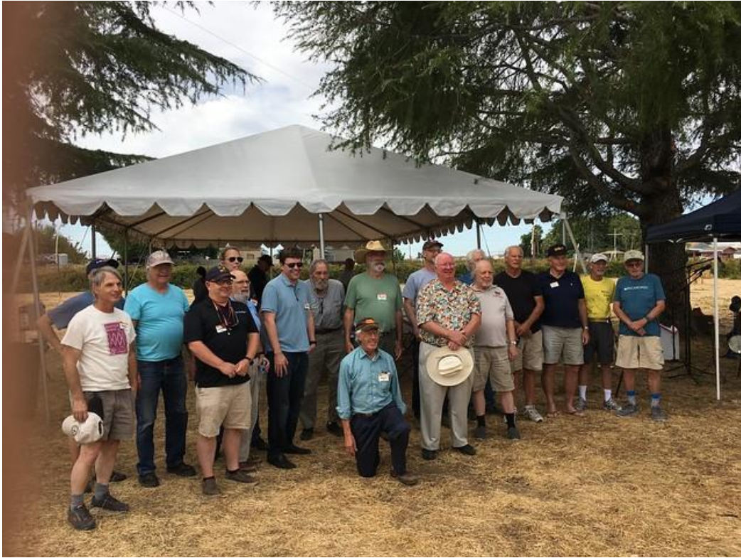
CW OP's Group at the BBQ (Photo-NA6O)