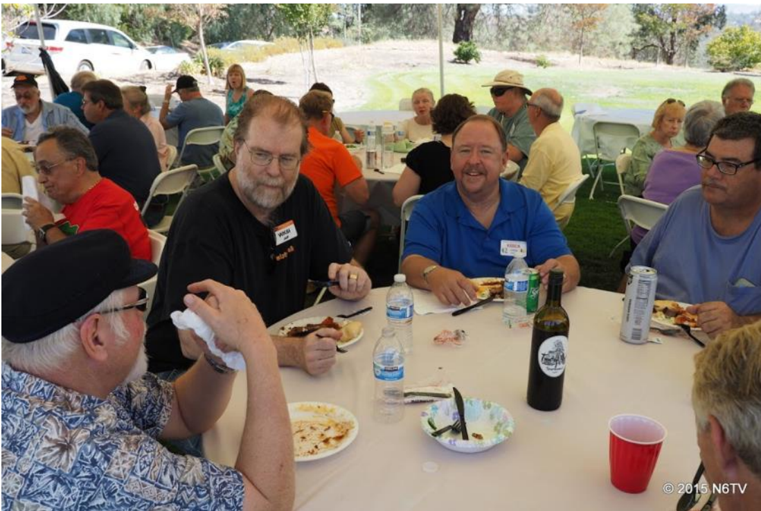
K6BEW, WK6I, K6SCA, KG6SVF