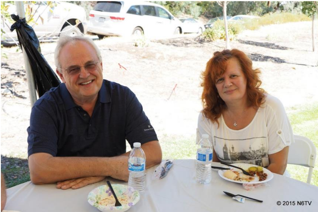
K6AAM/9A2AW and XYL