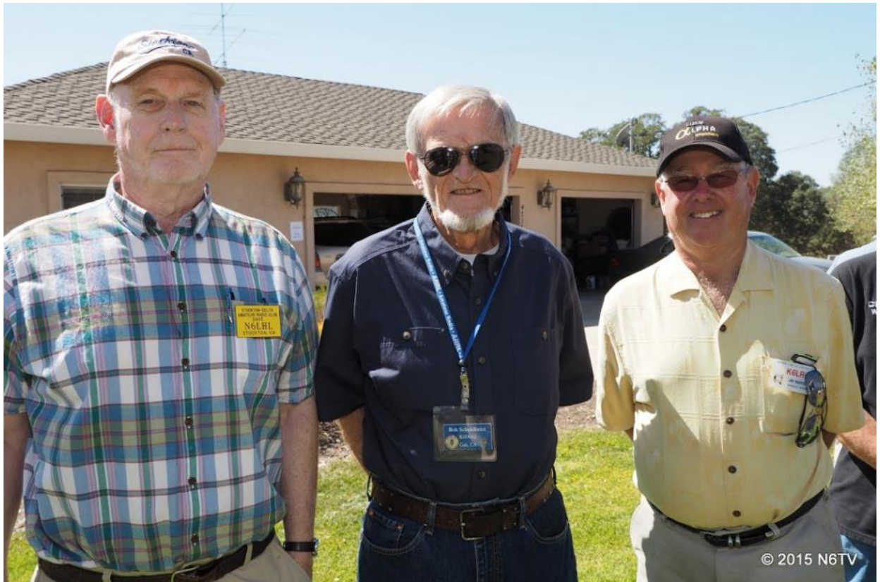
N6LHL, K6DGQ, K6LR