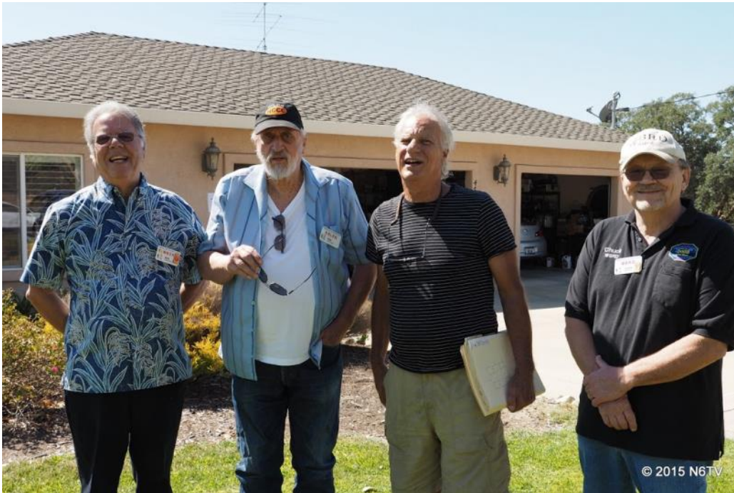
W6SR, K6LRN, K6SRZ, W6RD