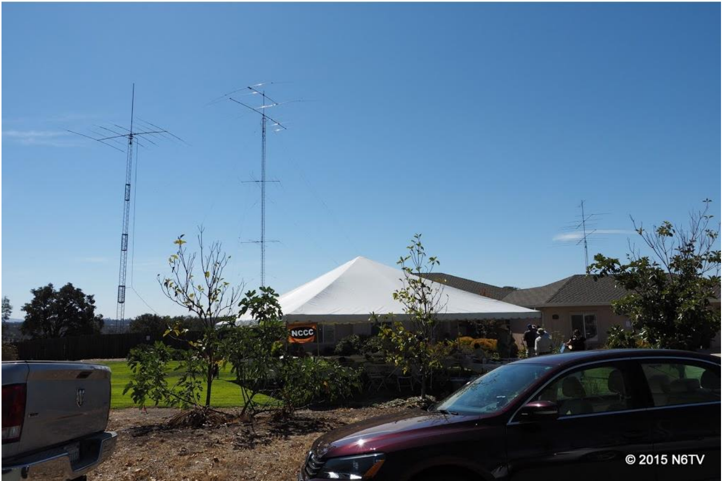
QTH of WC6H, Host of the BBQ