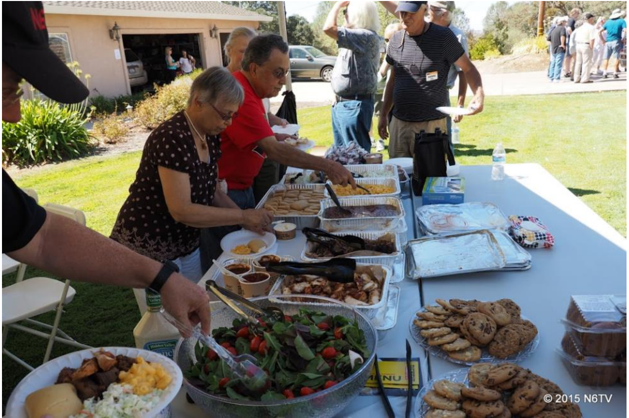
Dickey's BBQ -- great chow!