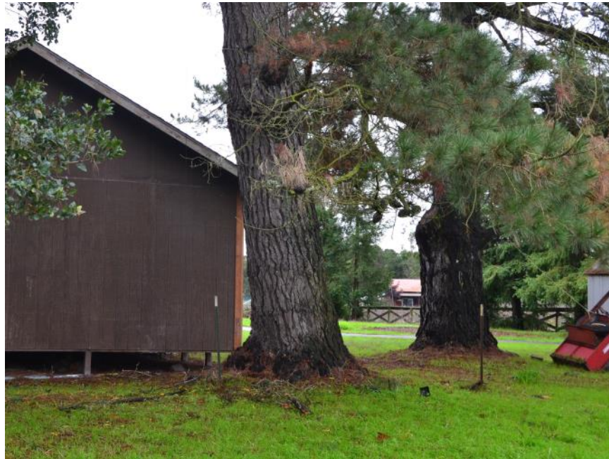
the ominous tilt

sagging timber with the potential to destroy our out-building, crush my receiving antennas, and probably eliminate a big chunk of my neighbor's fence.