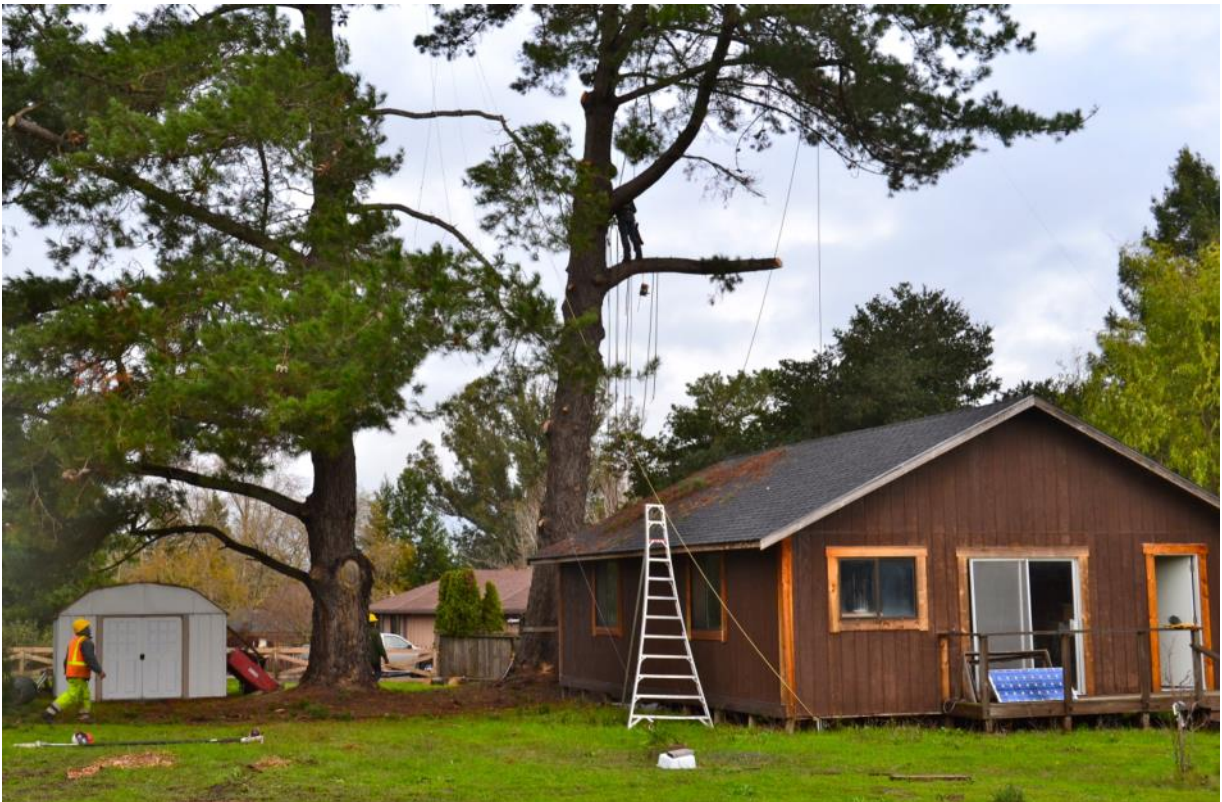
Down comes the tree

When we moved to Penngrove seven years ago, one of the things I really liked about the new place was the pair of tall Monterey pines on the North end of the property. The trees topped out over 90 feet. After years of living in Berkeley on the proverbial postage-stamp-sized lot, here was finally the cure to my low band blues.