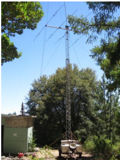
Antenna for the CW station.