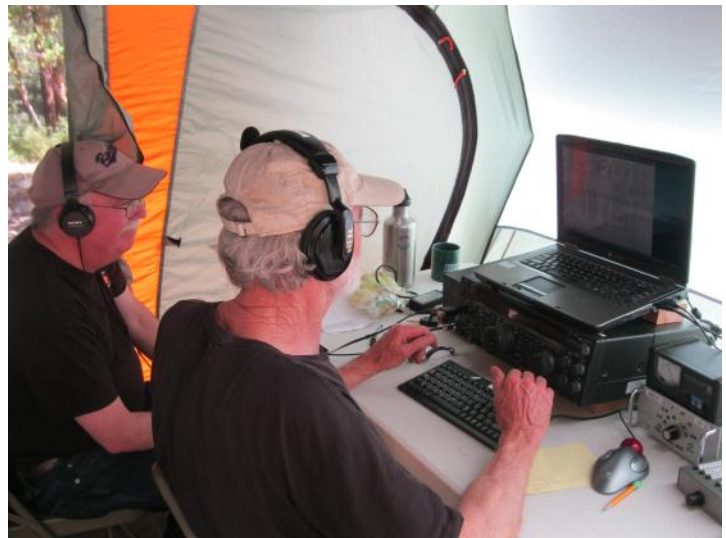
The CW station