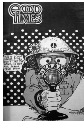
From the now defunct psychedelic 60s "Good Times"