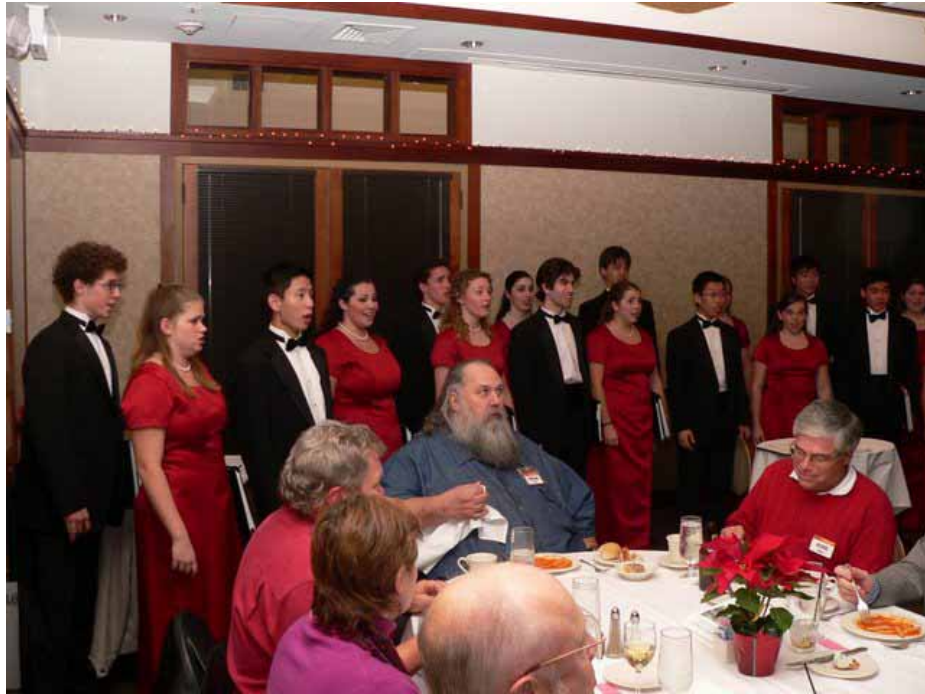
Main Street Singers from Los Altos High School