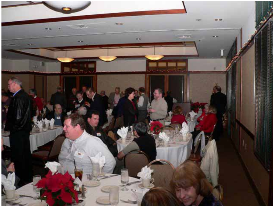
NCCC "gang" at December Holiday Dinner