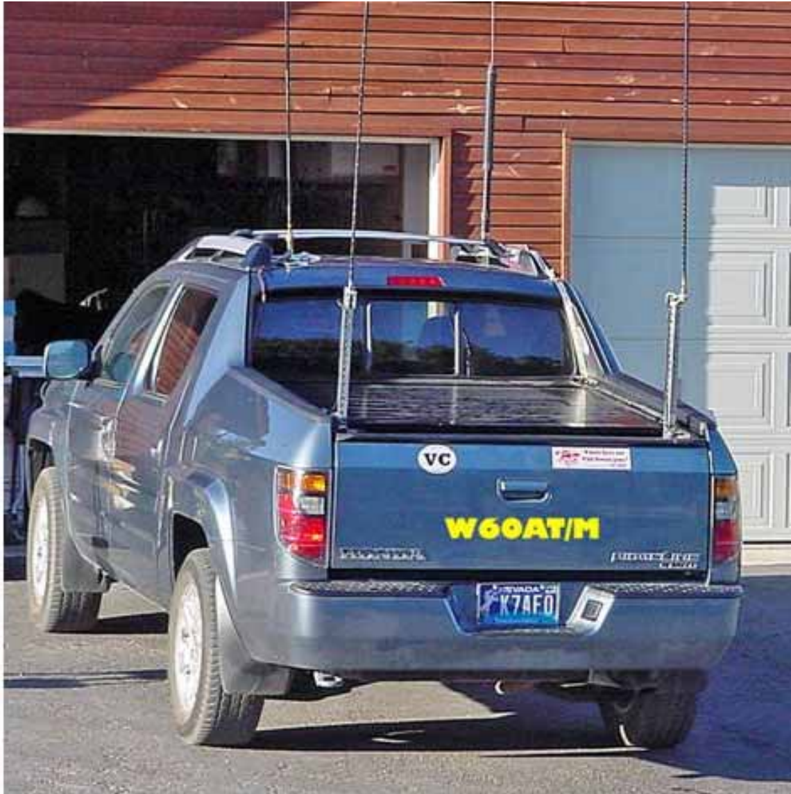
The Rusty and Tom mobile going be rolling down the highways of California during CQP