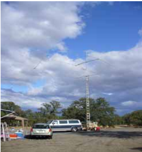
Tehama: N6RNO = NO6X, K6MI, WB6HYD, N3ZZ, K6VLF