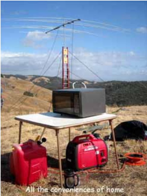
All the conveniences of home San Luis Obispo: N6XG, W6SC