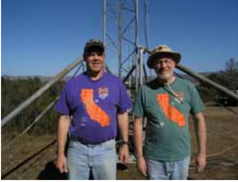
Monterey: N6RC & K6TD