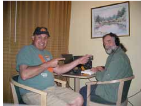
Kings = K6VVA & NI6T