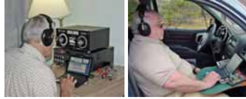
Mobile = W6OAT & K5RC