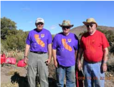
Alpine: N6A = K6DGW, W4UAT, W6OA, KQ6DI, KF6VU