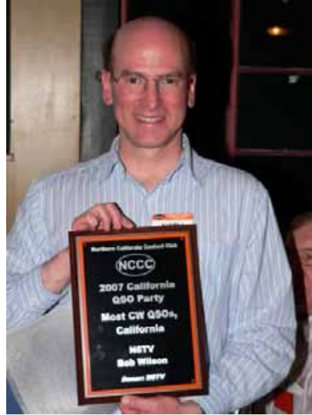
N6TV gets the "wood" for most CW QSOs in CQP 2007