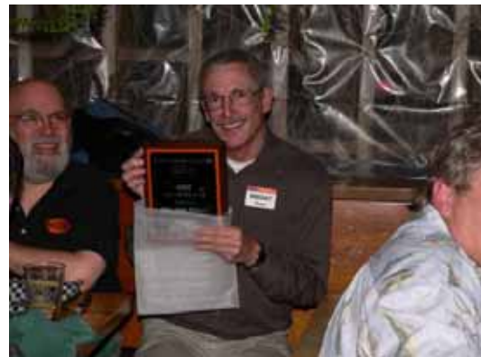
W6OAT accepts award for station K6IDX