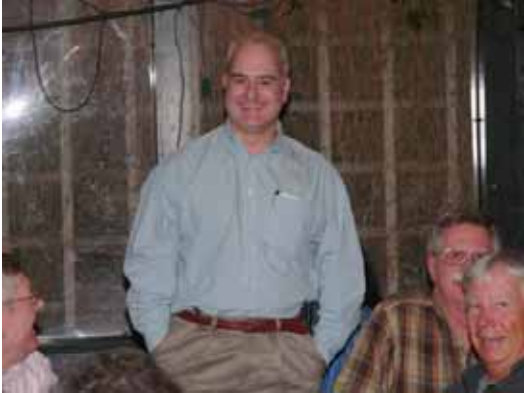
New member K5MEF