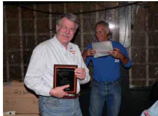
K6MM gets award for contester of the year