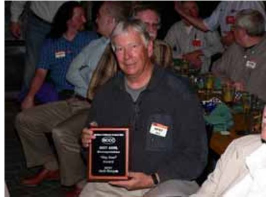
KF6T receives "Big Gun" Award