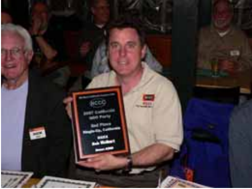
K6XX gets the "lumber" for 2 nd place finish in CQP