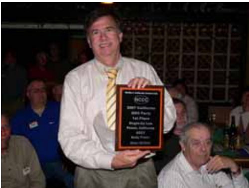
AE6Y takes 1 st place low-power in CQP