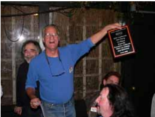
K6SRZ is 1 st place single op for expedition during CQP