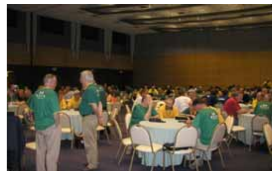
Competitors and referees meeting.