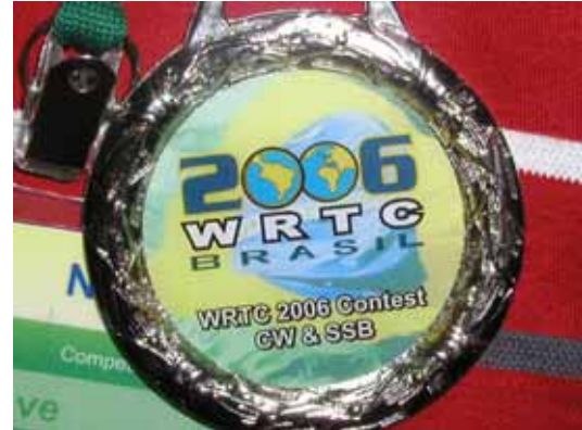
Silver medal for N6MJ and N2NL.