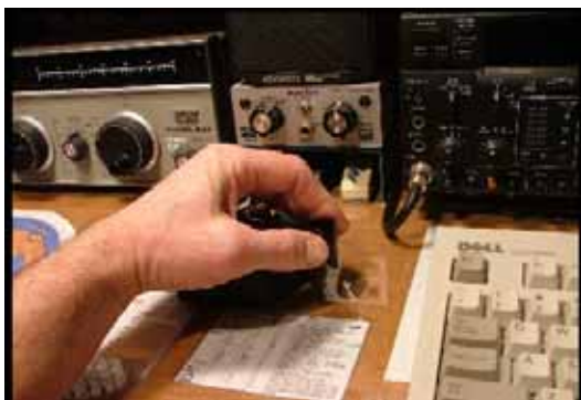
... to this.