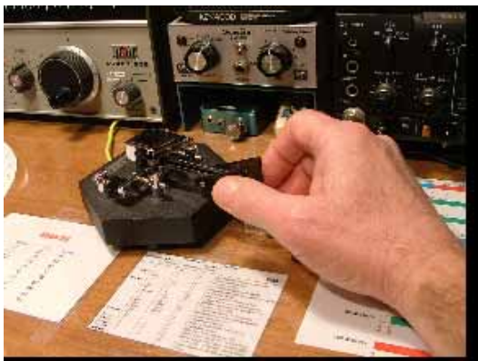
Ed’s two-handed CW technique goes from this...

Unlike Kurt, my method only uses one set of paddles. Since I am right handed, the normal position of the paddle for day to day use is to the left of the rig, so that my forearm rests on my desk (the “standard” position for sending). My keyboard is off to the right. However, during a contest, I move the keyboard directly in front of the rig, in the center of the operating position. The paddle is still off to the left, but there is now no room for my arm. However, I noticed that if I put my left hand forward in a straight position, my left thumb rests on the side of the paddle that my right thumb does. If I cupped my hand over the paddle, my left forefinger would be on the same side that my right normally is. My brain didn’t need to learn anything new, since my left thumb still made dashes, and my left finger still made dits, just like my normal sending hand. My hand is just backwards from what would be a “normal” position (fingers coming from the left, not the right side of the paddle).